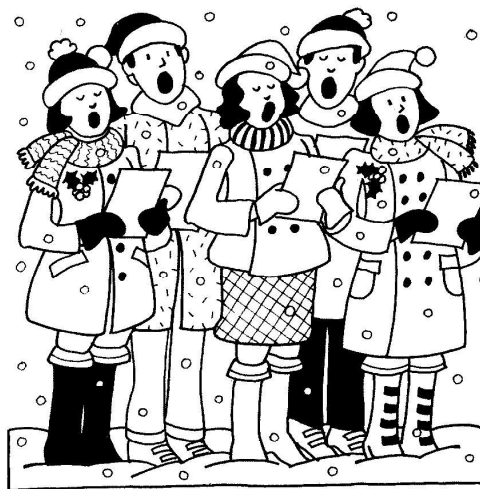
Merry Christmas! Happy Holidays!

Saturday, October 19, 7:30 p.m. 21st Annual Roar with Laughter hilarity revue Hispanic Cultural Center